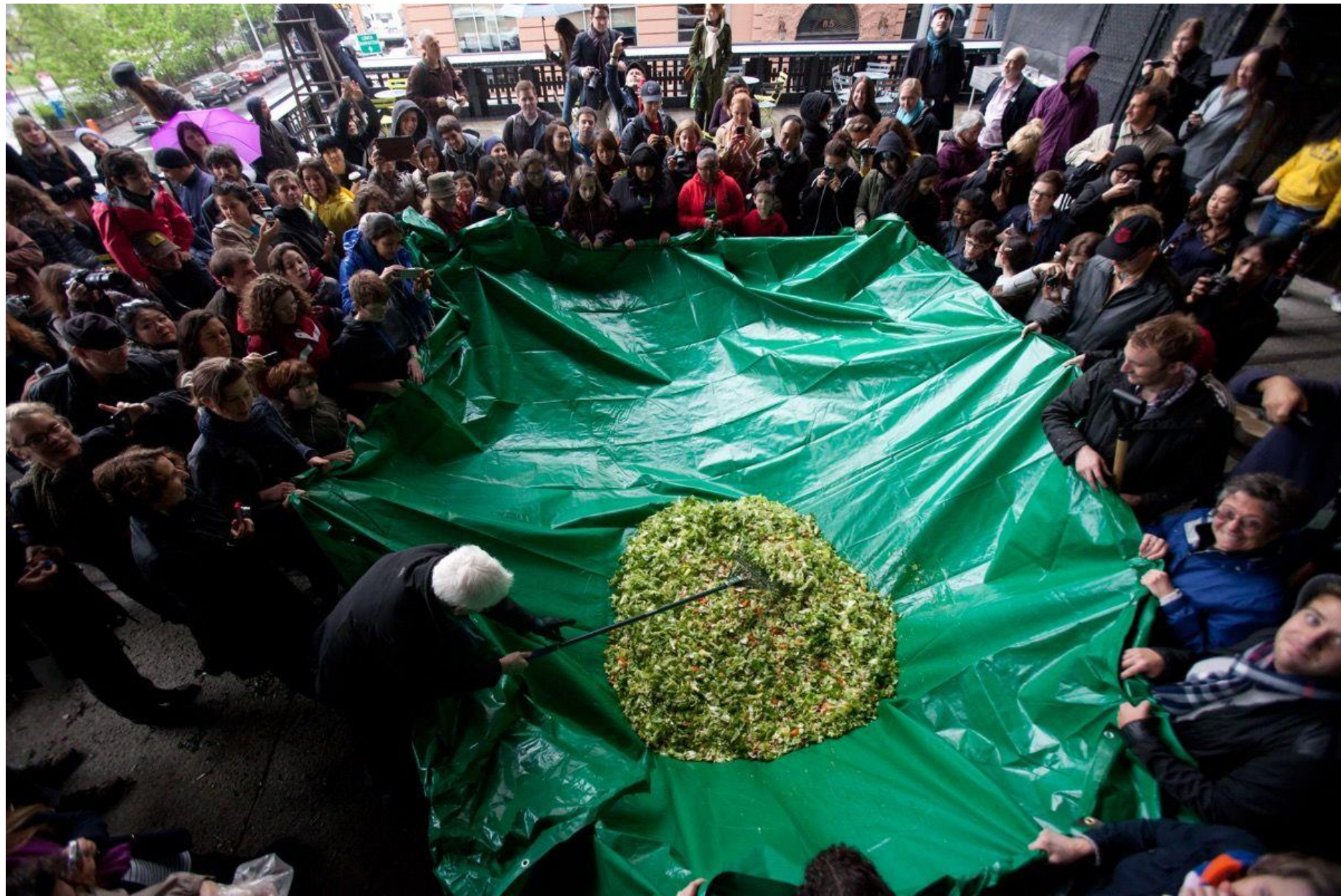
Make a Salad , Alison Knowles, first performed in 1962