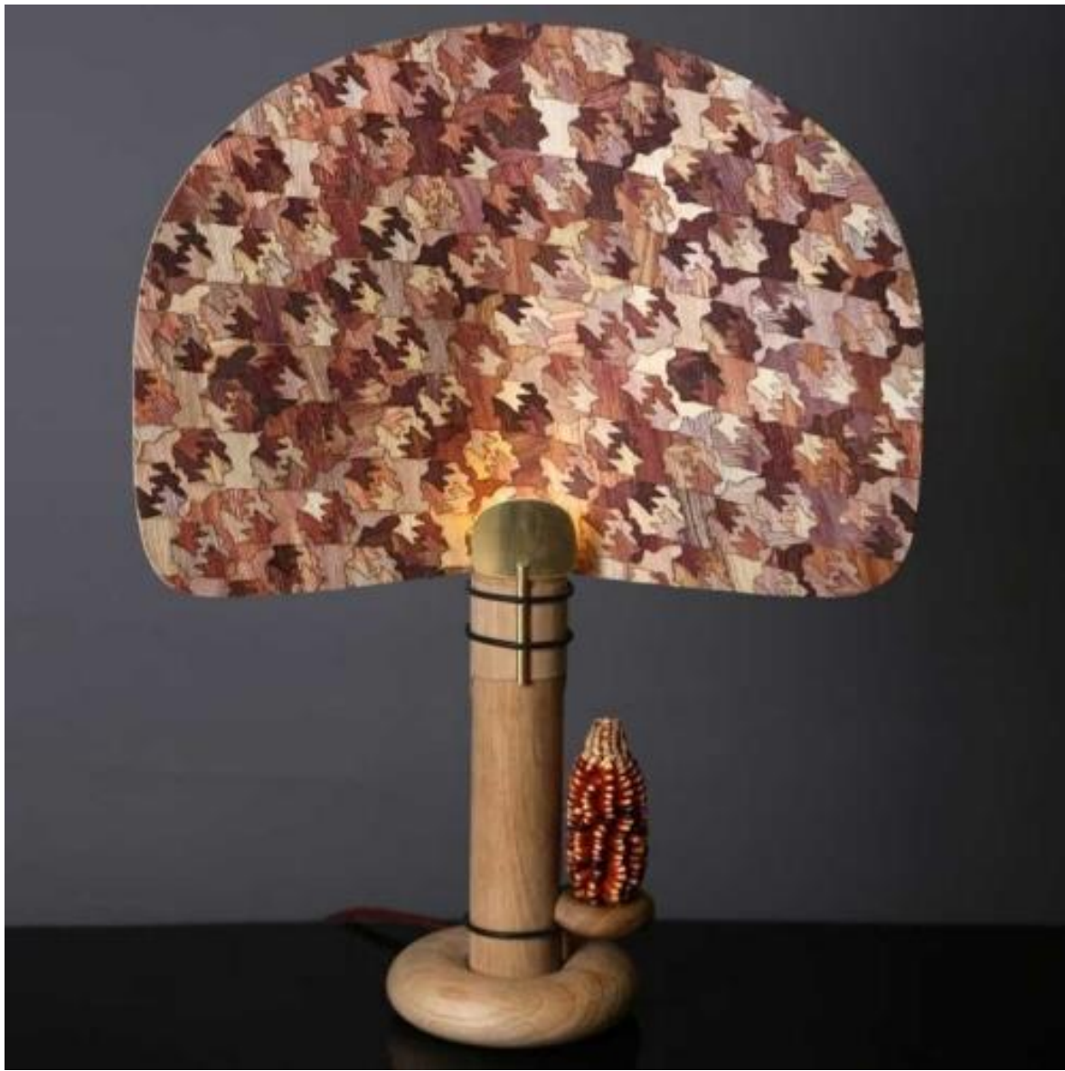
Totomoxtle , Fernando Laposse, 2019