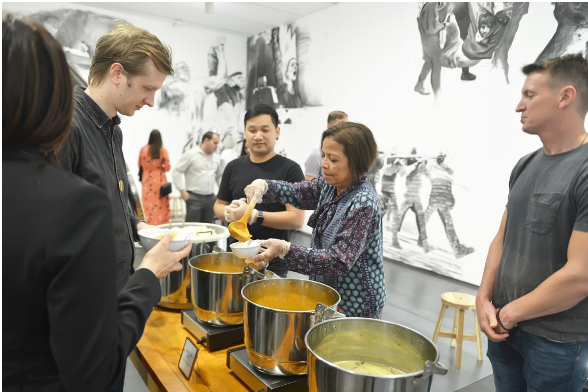
untitled (Free/Still), Rirkrit Tiravanija, first performed in 1991