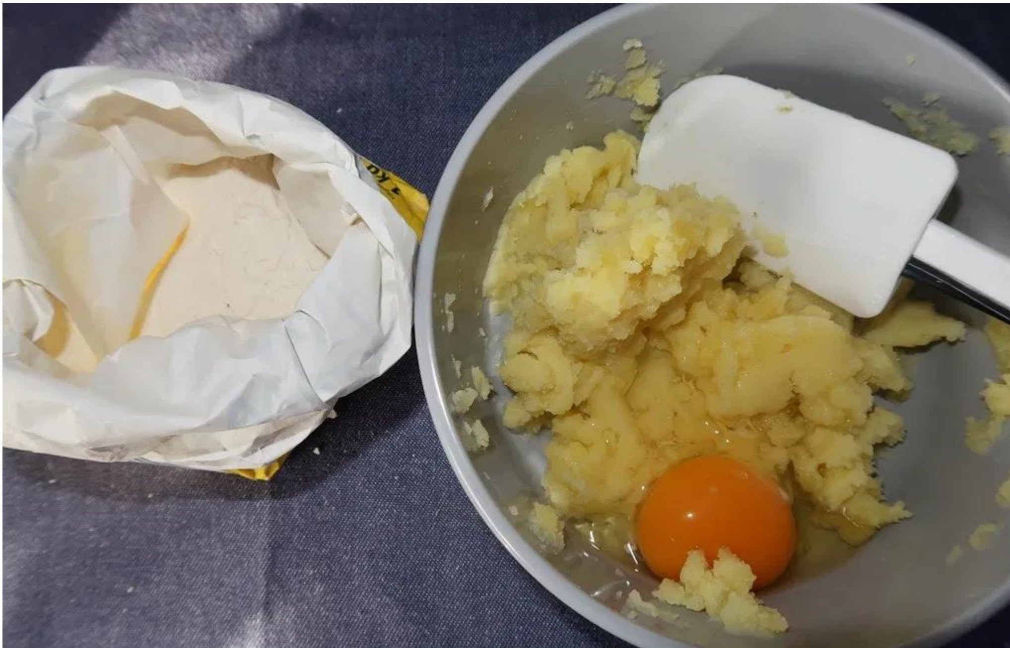
Danger Music Number Fifteen, Dick Higgins, first performed in 1962